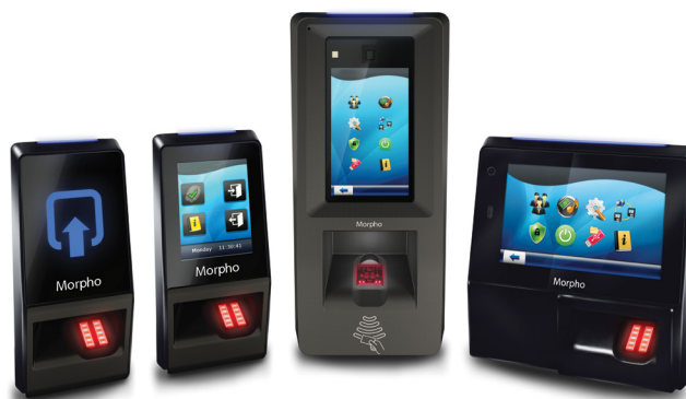
THE SIGMA FAMILY